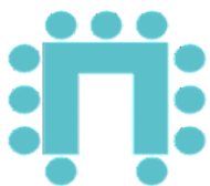
U - shape